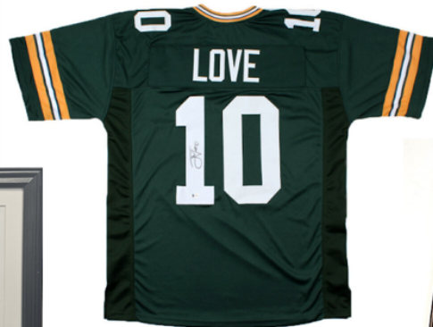
Jordan Love Signed Jersey