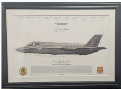
"Top Dogs" Signed Lithograph