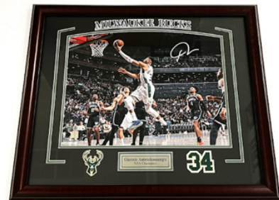
Giannis Antetokounmpo Signed Photo

Register Now - Rock4Vets24.givesmart.com